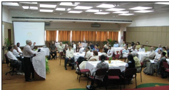
Workshop in Progress

In 6 groups, the participants deliberated upon values each of the different stakeholders need to 'imbibe and live' towards creating a value-based society.